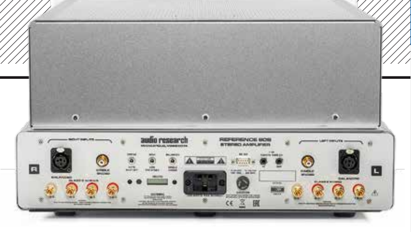
ABOVE: Small toggles switch between single-ended (RCA) and balanced (XLR) inputs, fan speed and auto-shut off (signal sensing). Tube hours are indicated beside a bladed IEC mains inlet, while 4mm speaker binding posts offer 16ohm, 8ohm and 4ohm taps

Nevertheless the REF80S commands sufficient presence, and down-to-earth 'grunt', to marshal tremendous sonic forces – necessary in realising the likes of Wagner's Ring Cycle [Duisburger Phil/Jonathan Darlington; Acousence ACO21309, 192kHz/24-bit]. This it does with not a little substance and style, the panoramic richness of the 105 players – including guests! – revealed across a gloriously wide and deep soundscape.